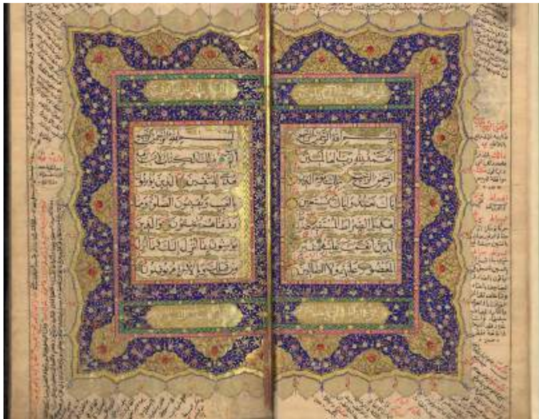
The richly illuminated pages of the Muṣḥaf Fadil-paša Šerifović (d. 1882)