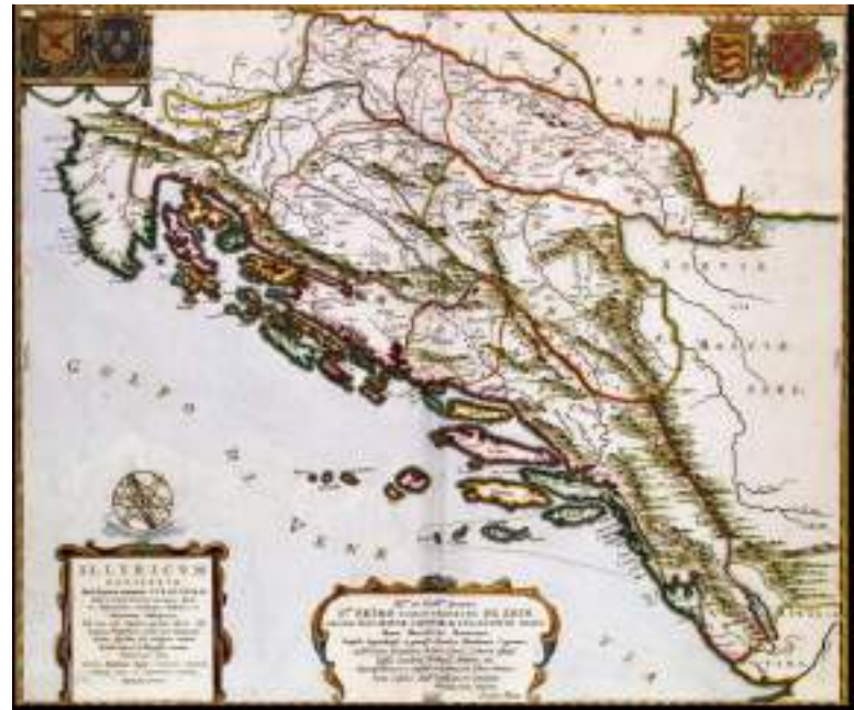
Map of the western Balkan region by Joan Blaeu, 1659