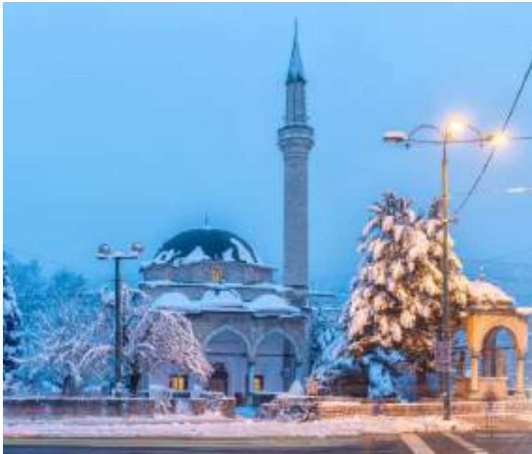
Alipašina Mosque, Sarajevo, 1560/61