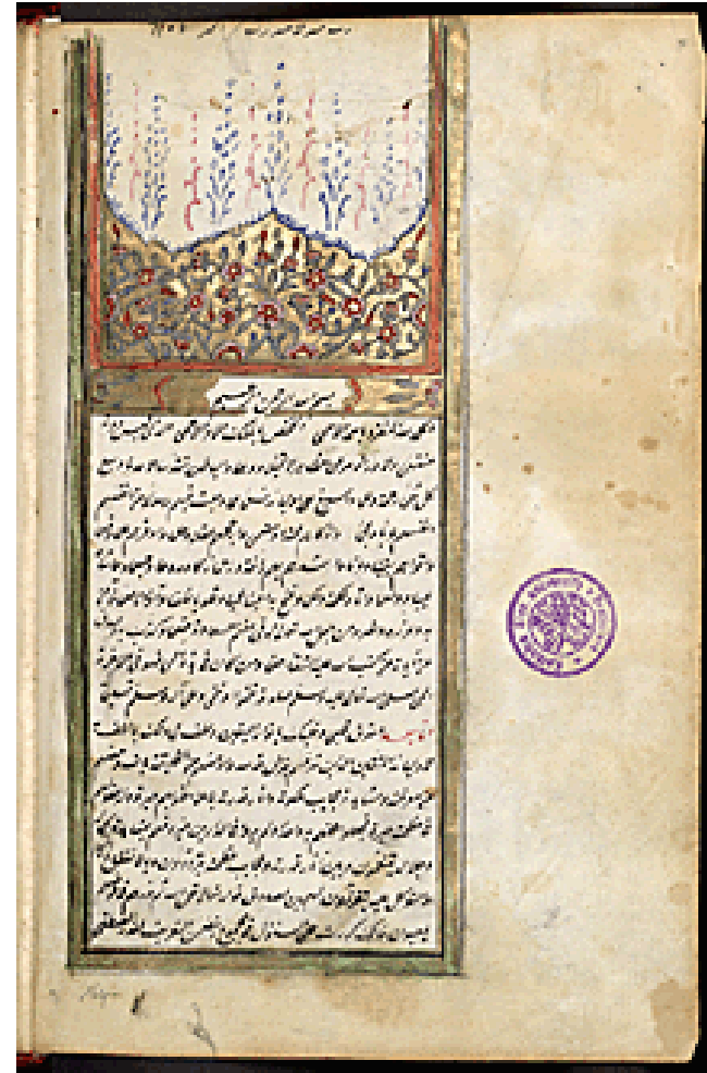
Abū al-Faḍl ‘Iyād al-Sabtī al-Mālikī, Kitāb al-shifā’ fī ta’rīf ḥuqūq al-Muṣṭafā