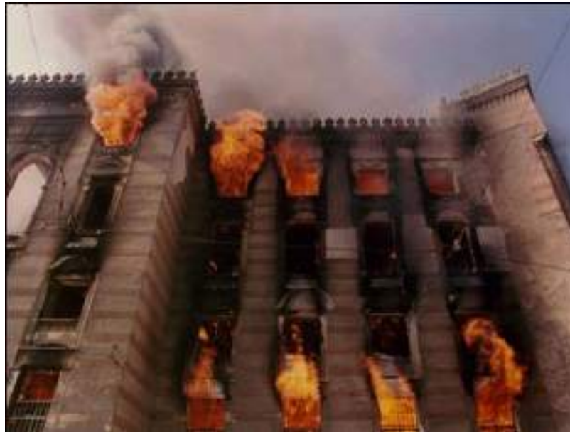
Sarajevo City Hall