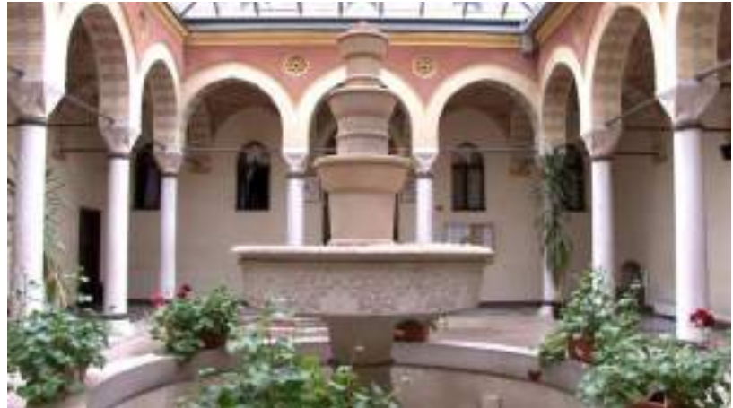
Faculty of Islamic Studies, University of Sarajevo