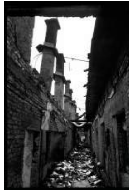
Oriental Institute, Sarajevo