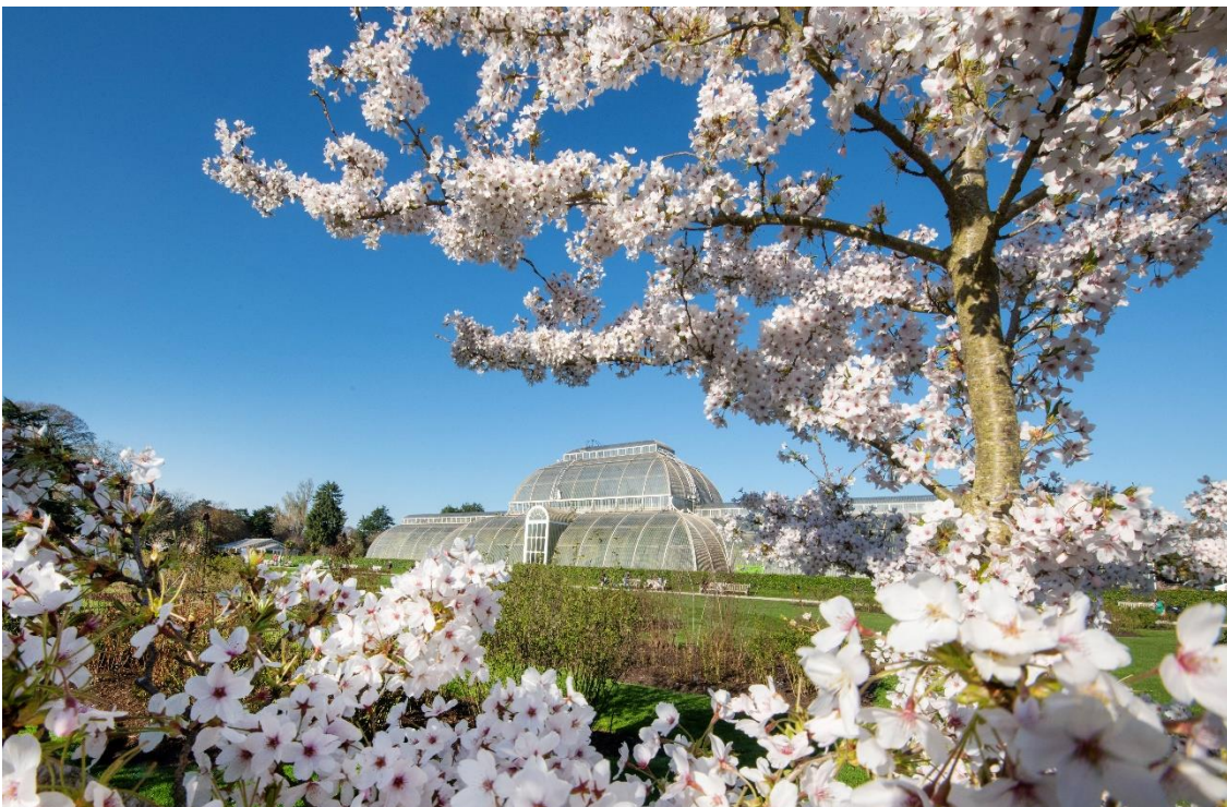
Image 3 Yoshi Cherry Tree at Kew Gardens

Walk around and discover an 18th-century, 10-storey Chinese pagoda, or a Japanese gateway amongst the lawns and gardens. Or stroll along the Treetop Walkway to view some of the gardens' 14,000 trees, and visit magnificent structures like the Royal Kew Palace and the Palm House – one of the largest surviving Victorian glasshouses.