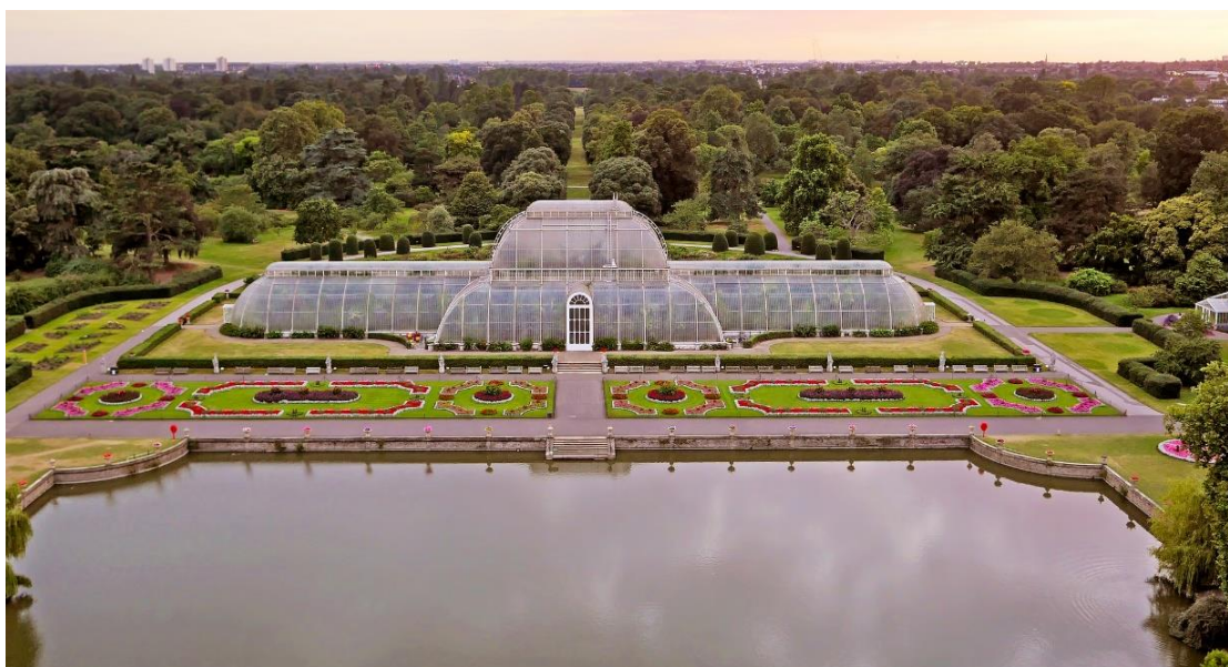
Image 1 Aerial view of Palm House at Kew Gardens

This year's excursion will be to London's Kew Gardens, followed by a Thames River boat cruise from Kew Gardens to Westminster on Friday 17th of May . The day will include an official tour of Kew Gardens (60-90 minutes).