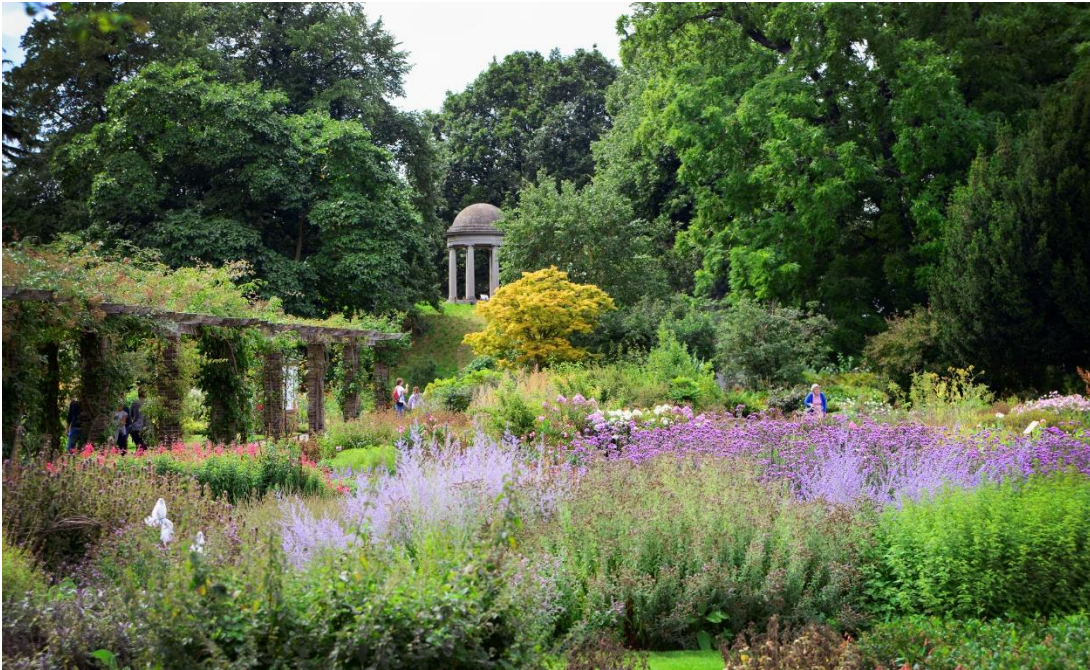
Image 2 Plant family beds in the Walled Herb Garden and the Temple of Aeolus at Kew Gardens.

Walk around and discover an 18th-century, 10-storey Chinese pagoda, or a Japanese gateway amongst the lawns and gardens. Or stroll along the Treetop Walkway to view some of the gardens' 14,000 trees, and visit magnificent structures like the Royal Kew Palace and the Palm House – one of the largest surviving Victorian glasshouses.