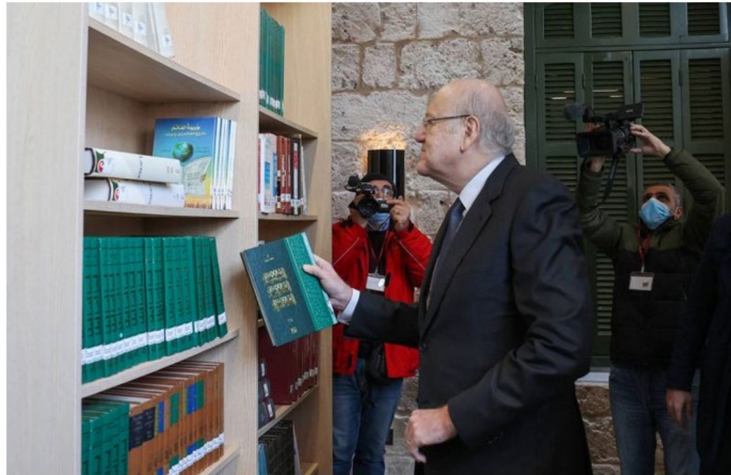
Prime Minister Najib Mikati browses through books during the reopening ceremony of the National Library in Beirut, February 10, 2022, upon completion of restoration work in the aftermath of the summer 2020 port explosion.

L'Orient Today / By Richard SALAME , 10 February 2022 15:20